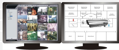
CCTV / E-Map