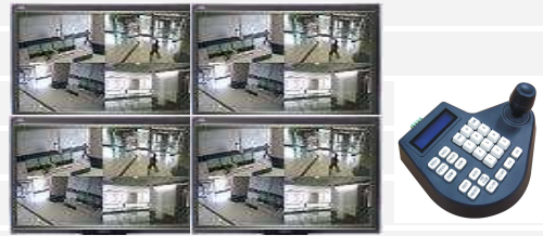
TV Wall Matrix with Control Keyboard