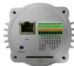
Local SD Card Storage (optional)