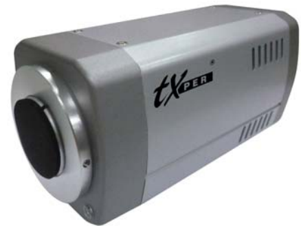
nCam-13213 (NTSC) nCam-23213 (PAL)

It provides round-the-clock, high quality H.264 video with Internet Protocol. Its remote monitoring applications allow homeowners and businesses to view their camera(s) through any internet connection available through a computer or a 3G phone