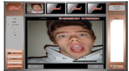
Instant intercommunication with live video when an event occurs