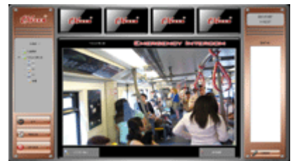
Monitor any device any time