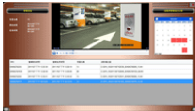
Playback of event footage from alarm log