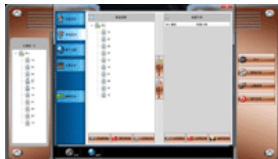
Device group management