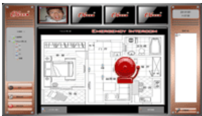
Instant alarm notification on E-Map