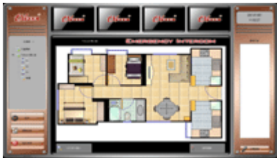
Immediate and full control of any incident with user-friendly GUI and E-Map