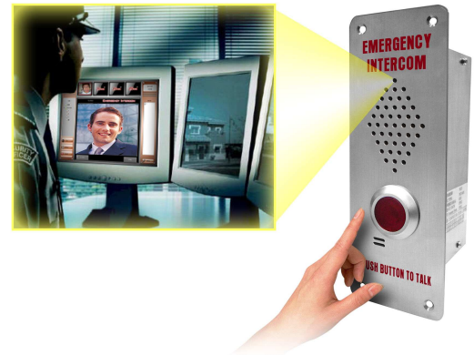
nEI-NTSC / nEI-PAL