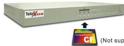
CF (Not supplied)

Via external PC + built-in CF interface Data includes - Multi-ch Video - Multi-ch Audio - View software