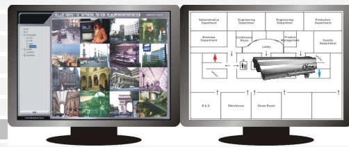
CCTV / E-Map