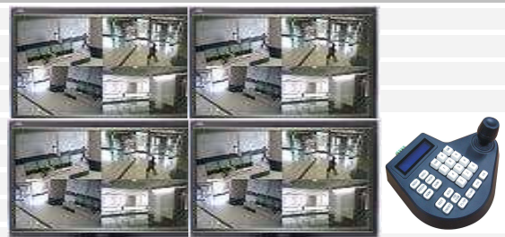
TV Wall Matrix with Control Keyboard