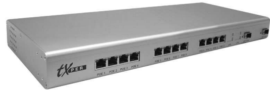
nHUB-12P2U (12port POE + 2port UTP) nHUB-12P2S (12port POE + 2port SFP)